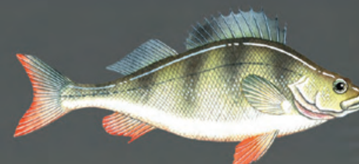
Redfin (English perch)

Carp is declared a "noxious" aquatic species in Victoria which makes it an offence to possess, transport or release live carp, or use live carp (including all forms of carp and goldfish) as fishing bait. *The declaration of 'noxious' fish does not mean that the species cannot be fished for, or eaten. DO NOT RETURN CARP ALIVE TO THE WATERWAY.