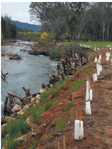
Top photo: Fishing in the Rubicon River

To find out more please visit: www.vfa.vic.gov.au