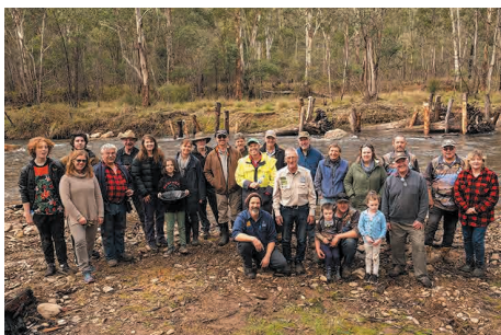
Top photo: Trout fisher, Ovens River